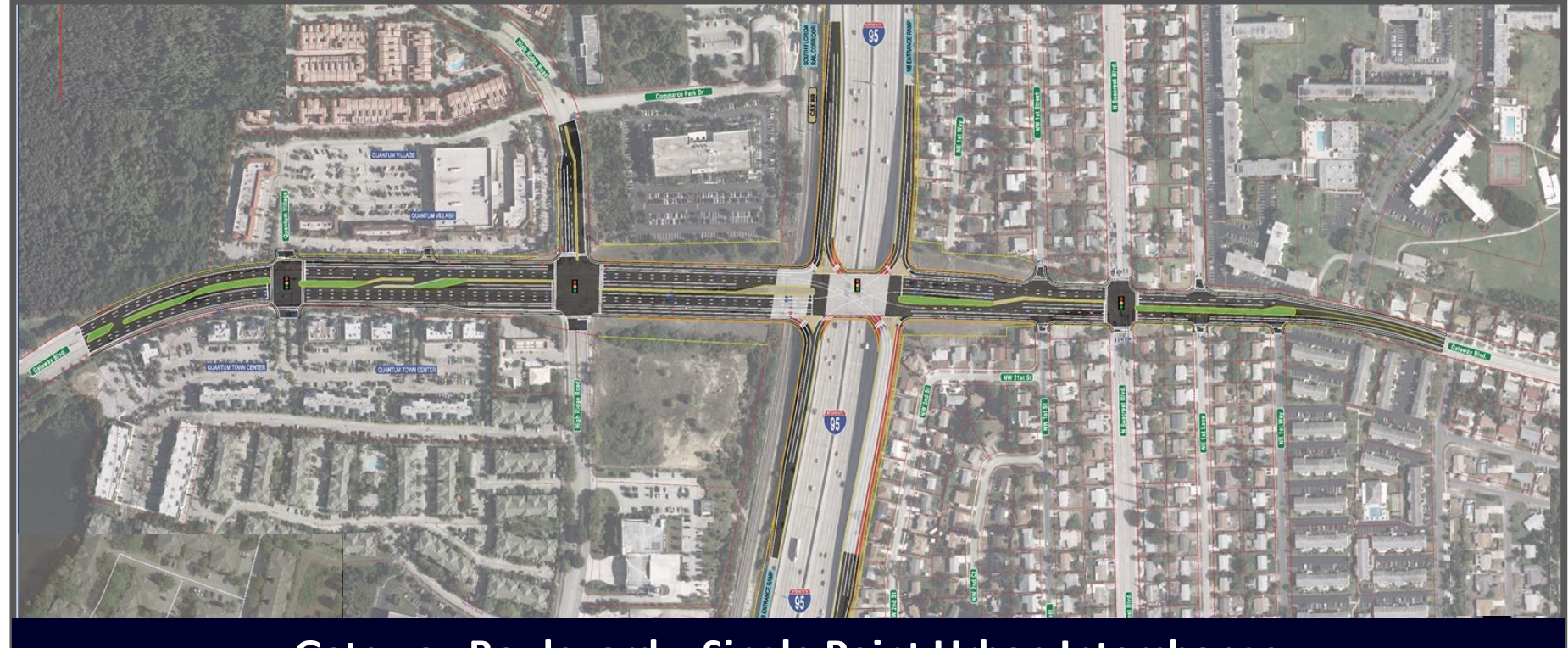
Gateway Boulevard – Single Point Urban Interchange