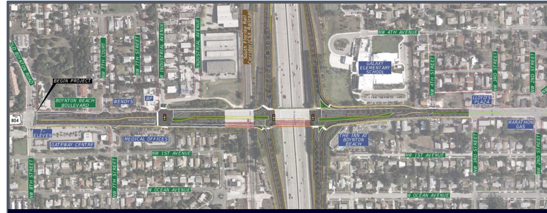
Boynton Beach Boulevard – Streamlined Concept Development Alternative